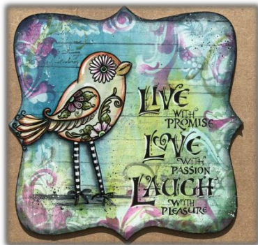
Live Love Laugh Mixed Media – March 21