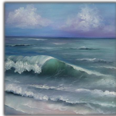
Seascape – March 20